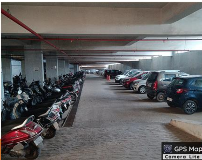
MIT School Of Distance Education (MITSDE) MIT, Campus, opposite Gajanan Maharaj Sansthan, Alandi, Pune, Maharashtra 412105, India 🇮🇳

Latitude Longitude 18.6728733333333° 73.8892216666666° Local 02:37:26 PM Altitude 575 meters GMT 09:07:26 AM Monday, 01.12.2025